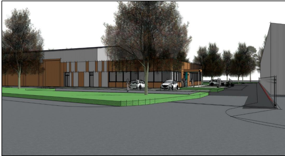
View from Access Road